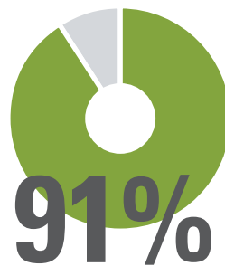
National CORE families who would use a licensed preschool if an affordable, accessible preschool were available (National CORE research)

At least half the educational achievement gaps between poor and non-poor children exist at kindergarten entry; the larger the gap, the harder it is to close.