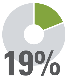
Preschool slots available (California Child Care Portfolio, 2007)