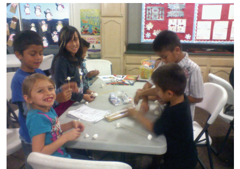
Youth at Bravo working together