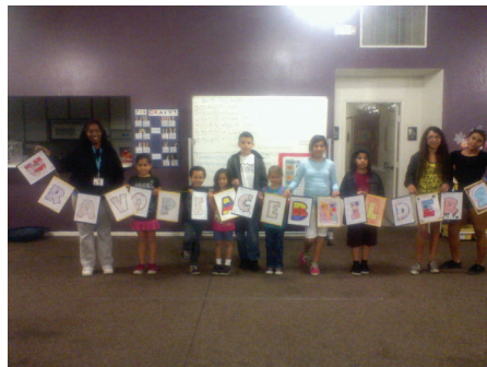
Bravo Peace Builders!

In addition, the Bravo After School Program regularly promotes community involvement through their many events held throughout the year. In the photos below, you can see the smiling faces at their recent Taco Tuesday Event. Way to keep the peace Bravo!