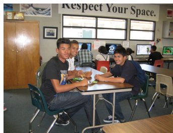
Right Top: Students enjoying a snack and getting some work done on the computers.